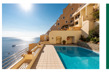
PORTA MALLORQUINA® Your home. Our passion.