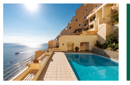
PORTA MALLORQUINA® Your home. Our passion.