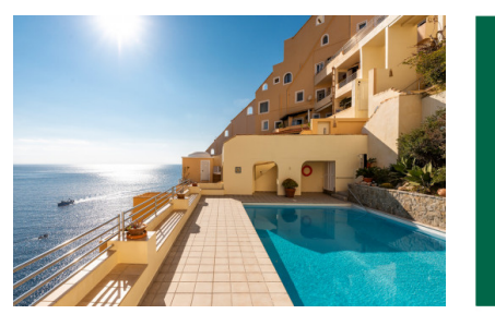
PORTA MALLORQUINA<sup>®</sup> Your home. Our passion.