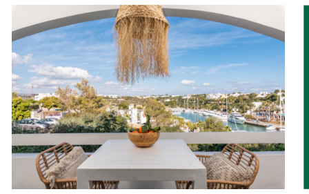
Cala d'Or référence du bien 119559

PORTA MALLORQUINA<sup>®</sup> Your home. Our passion.