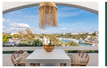
PORTA MALLORQUINA® Your home. Our passion.