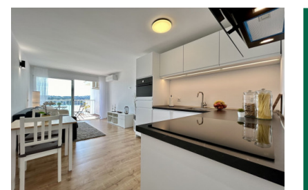
PORTA MALLORQUINA® Your home. Our passion.