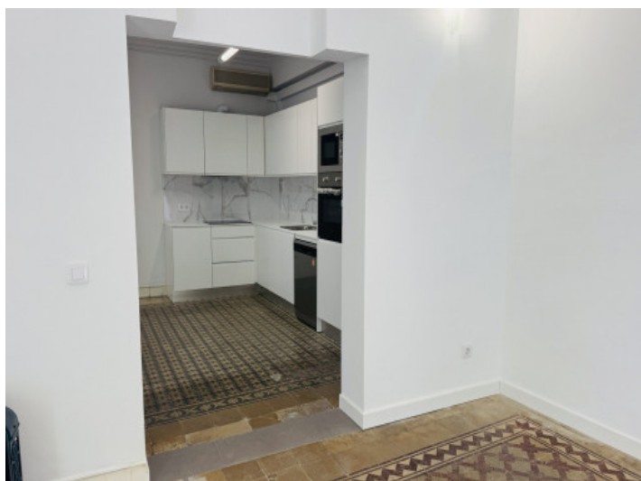
View from the living area into the kitchen