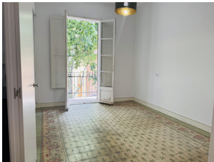
One of the four bedrooms