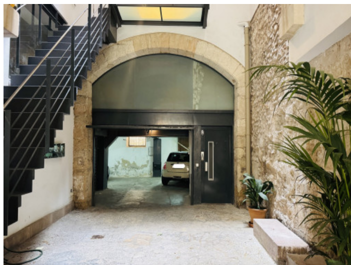
Entrance area with access to the garage

All information is correct to the best of our knowledge. Errors and prior sale excepted. This prospectus is purely for information purposes. Only the notarized deed of sale is legally binding.