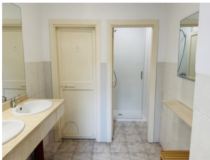
One of the two bathrooms