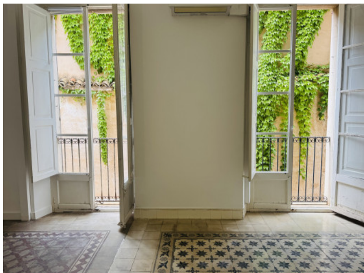
View from the living-dining area