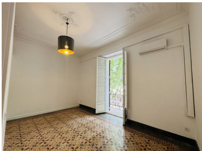
One of the four bedrooms