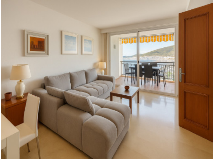
Living room with sea views and access to the balcony