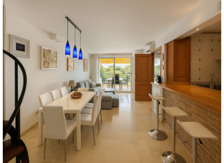
Dining area and American kitchen