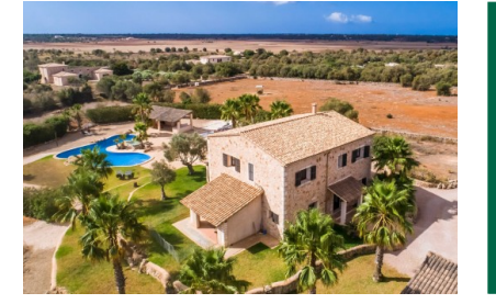
Santanyi référence du bien 117188

PORTA MALLORQUINA® Your home. Our passion.