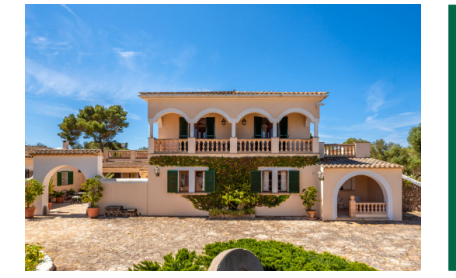
Sa Torre référence du bien 119865

PORTA MALLORQUINA® Your home. Our passion.