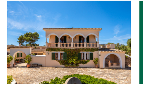
Sa Torre référence du bien 119865