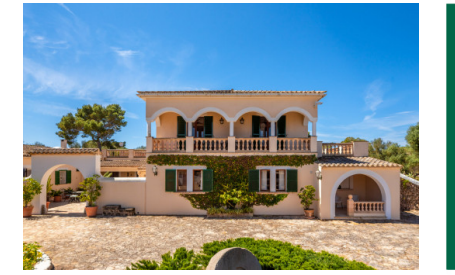
Sa Torre référence du bien 119865

PORTA MALLORQUINA® Your home. Our passion.