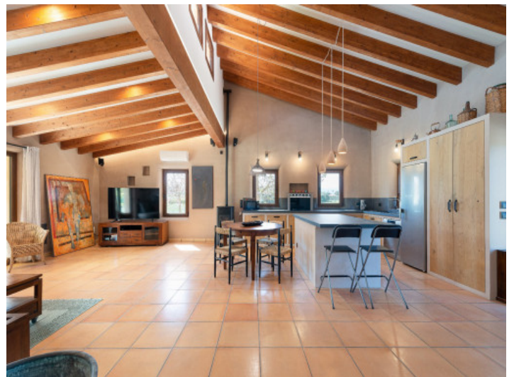
Open Kitchen with Natural Warmth

All information is correct to the best of our knowledge. Errors and prior sale excepted. This prospectus is purely for information purposes. Only the notarized deed of sale is legally binding.