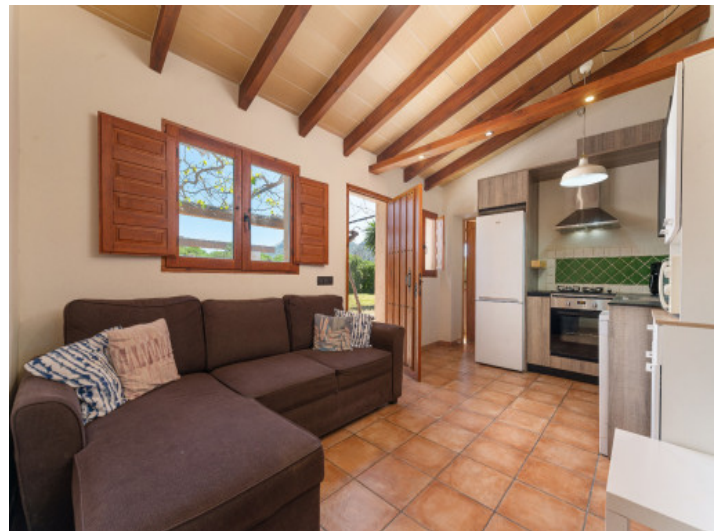
Living-dining area with open kitchen in the guest house