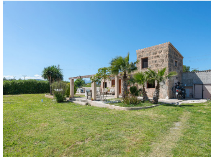
Stone House with Mallorcan Soul