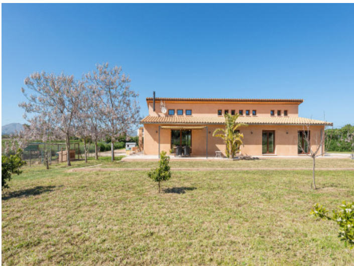
Casa sostenible con vistas y jardín en flor