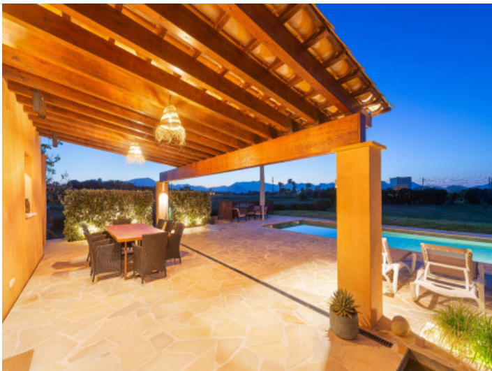
Evenings with Tramuntana Mountain Views