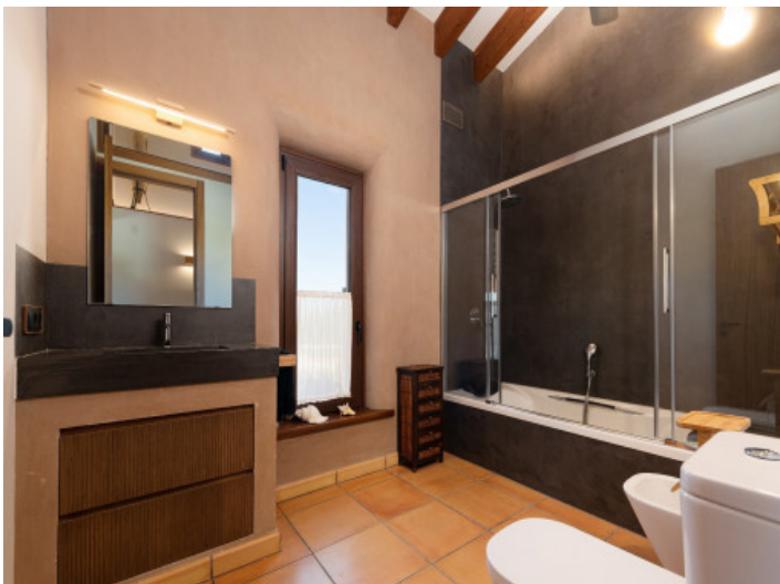
Separate individual bathroom with bathtub