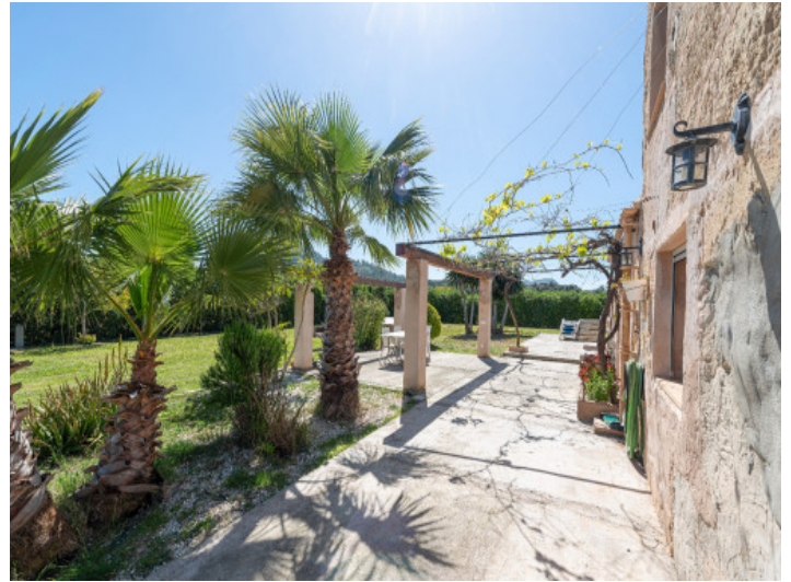
Mediterranean Terrace by the Guest House