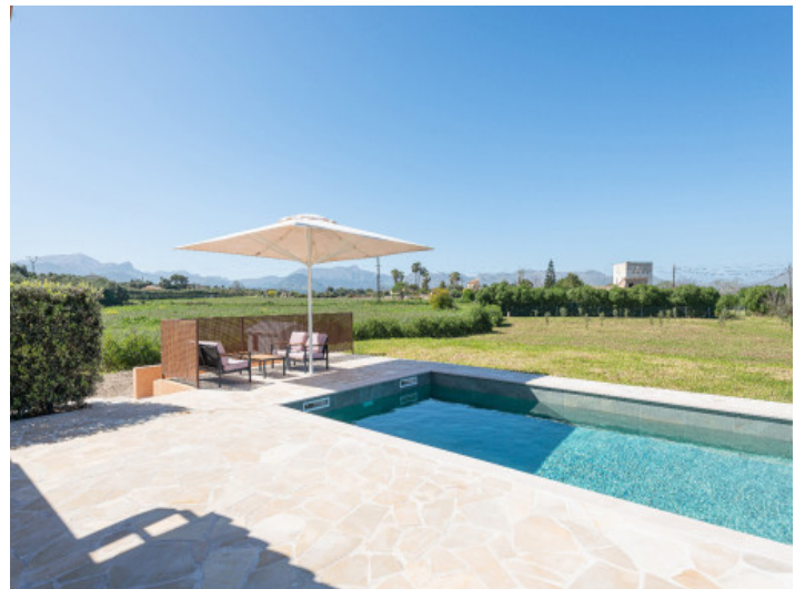
Pool with Views of Rural Serenity