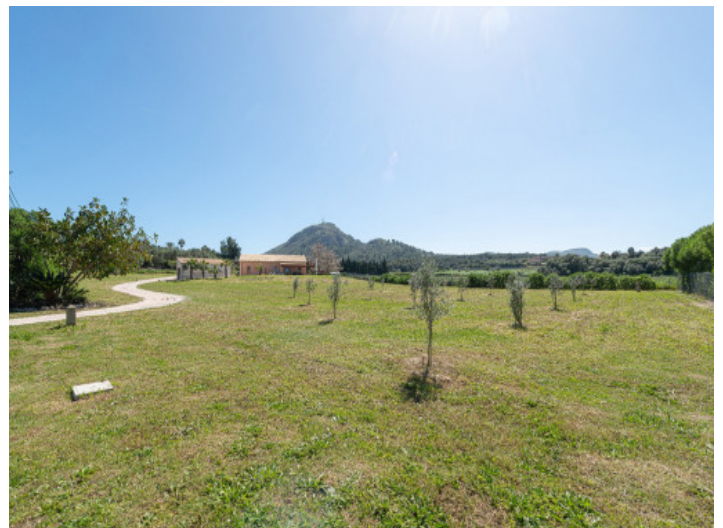
Panoramic View of the Land with Olive Trees, Finca and Garage

All information is correct to the best of our knowledge. Errors and prior sale excepted. This prospectus is purely for information purposes. Only the notarized deed of sale is legally binding.