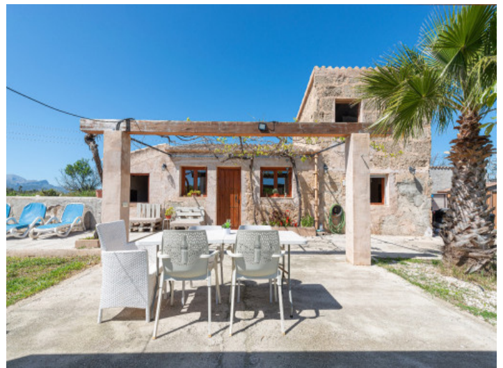
Historic Guest House with Sunny Terrace

All information is correct to the best of our knowledge. Errors and prior sale excepted. This prospectus is purely for information purposes. Only the notarized deed of sale is legally binding.