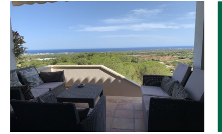
PORTA MALLORQUINA® Your home. Our passion.