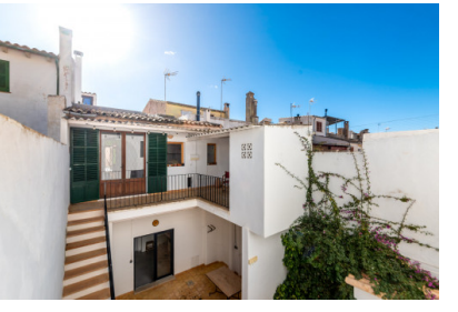
Llucmajor référence du bien 121291

PORTA MALLORQUINA® Your home. Our passion.