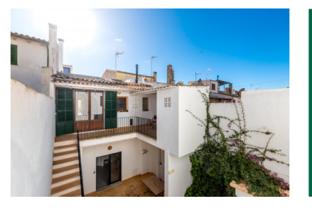
Llucmajor référence du bien 121291

PORTA MALLORQUINA® Your home. Our passion.