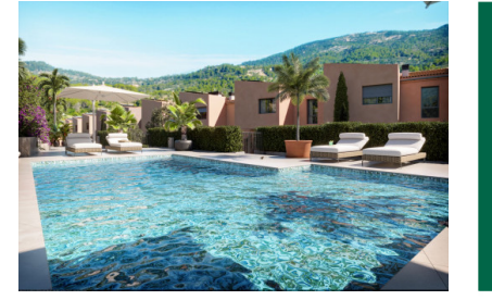
Esporles référence du bien 121324B

PORTA MALLORQUINA® Your home. Our passion.