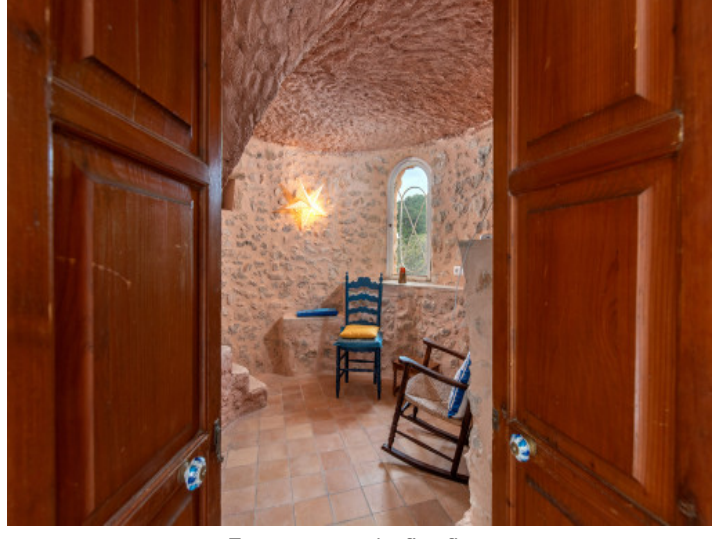
Towerroom on the first floor

All information is correct to the best of our knowledge. Errors and prior sale excepted. This prospectus is purely for information purposes. Only the notarized deed of sale is legally binding.