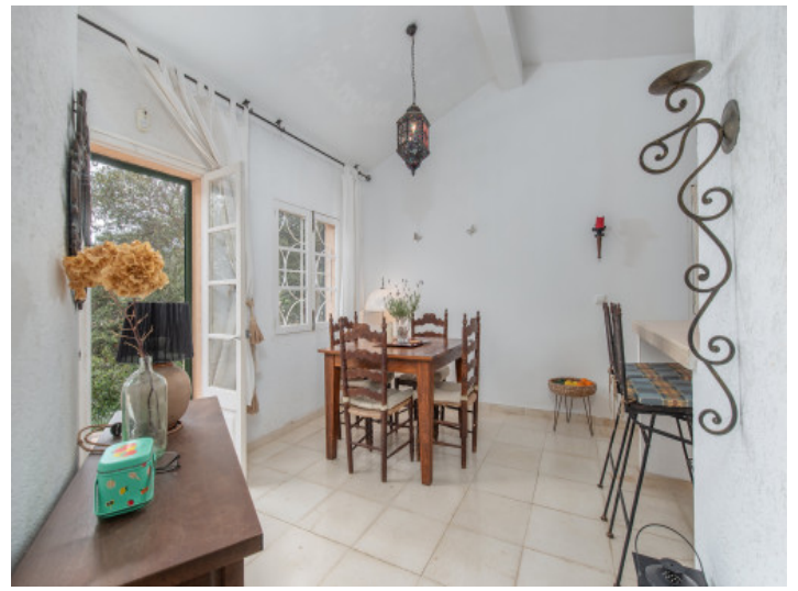
Dining area with access to the terrace