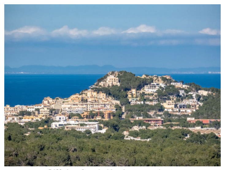
360° views from the historic tower on the top