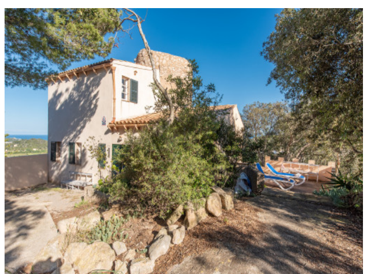
Garden with views over the town of Capdepera