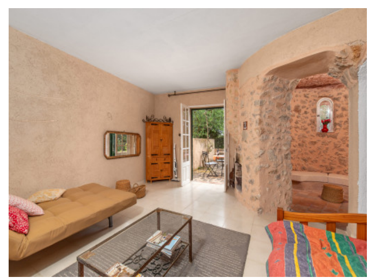
Living area with tower room and access to outdoor space