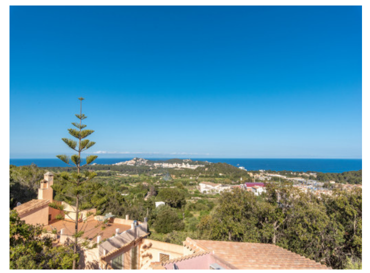
Views from the roof top of the tower