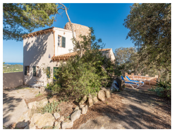
House in Capdepera with a 850 years old watchtower