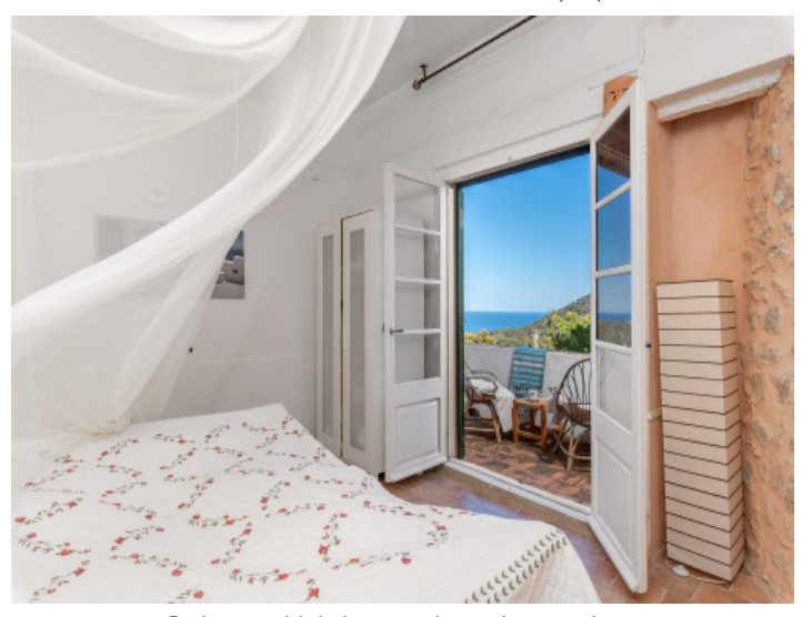
Bedroom with balcony and amazing sea views