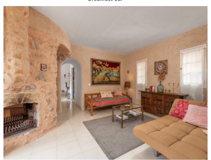
Living area with open fireplace