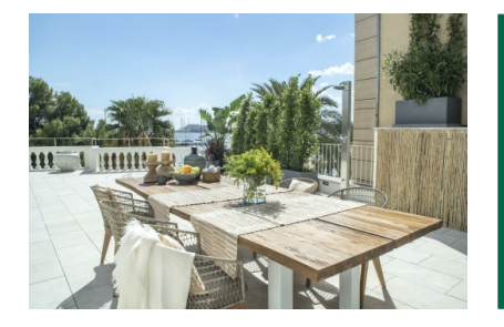
Paseo Maritimo référence du bien 077627

PORTA MALLORQUINA® Your home. Our passion.