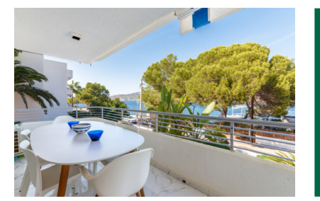
Santa Ponsa référence du bien 120730