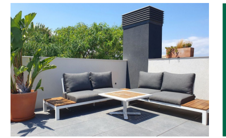
Portixol référence du bien 122111

PORTA MALLORQUINA® Your home. Our passion.