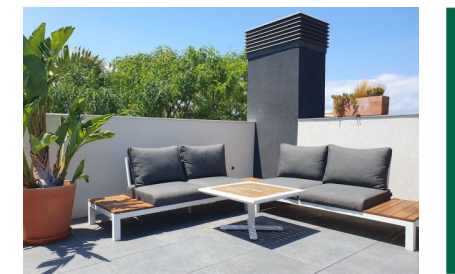
Portixol référence du bien 122111

PORTA MALLORQUINA<sup>®</sup> Your home. Our passion.