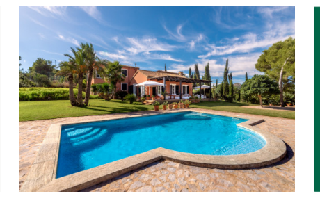
Arta référence du bien 105202

PORTA MALLORQUINA® Your home. Our passion.