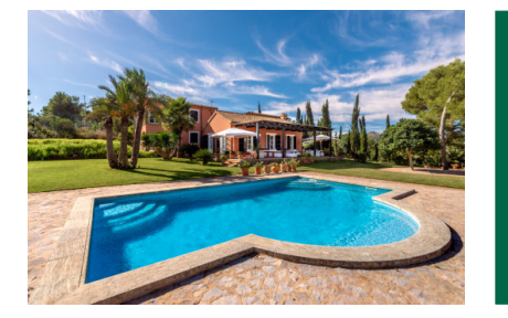
Arta référence du bien 105202

PORTA MALLORQUINA® Your home. Our passion.