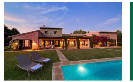
Calvia référence du bien 112602