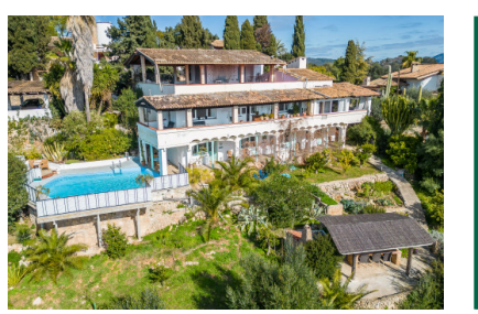
Buger référence du bien 119097

PORTA MALLORQUINA® Your home. Our passion.