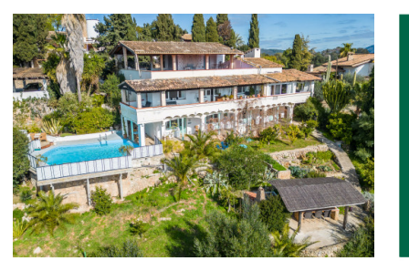
Buger référence du bien 119097

PORTA MALLORQUINA® Your home. Our passion.