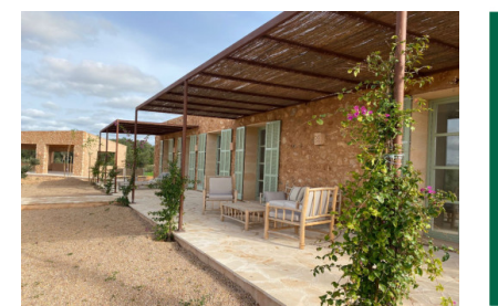
PORTA MALLORQUINA® Your home. Our passion.