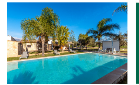
Inca référence du bien 119426

PORTA MALLORQUINA<sup>®</sup> Your home. Our passion.