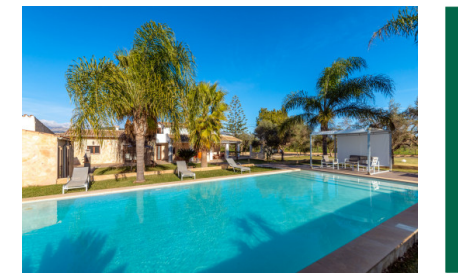
Inca référence du bien 119426

PORTA MALLORQUINA® Your home. Our passion.