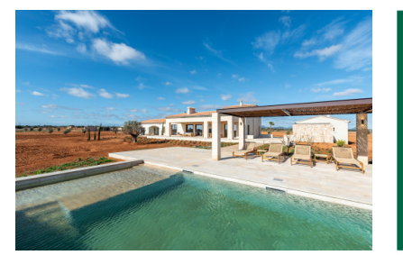
Sa Rapita référence du bien 119506

PORTA MALLORQUINA® Your home. Our passion.