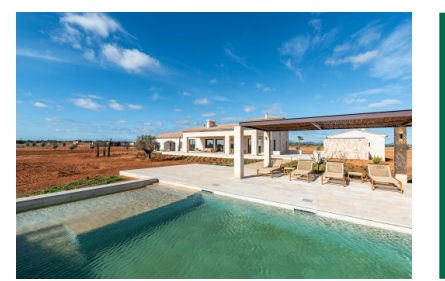
Sa Rapita référence du bien 119506

PORTA MALLORQUINA® Your home. Our passion.