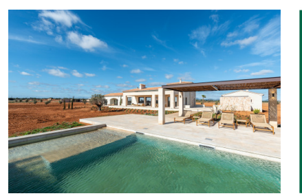
Sa Rapita référence du bien 119506

PORTA MALLORQUINA® Your home. Our passion.