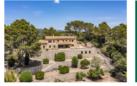
Galilea référence du bien 120182

PORTA MALLORQUINA® Your home. Our passion.