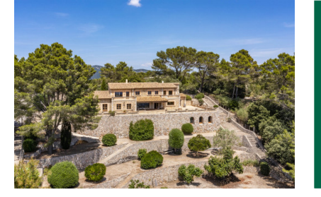
Galilea référence du bien 120182