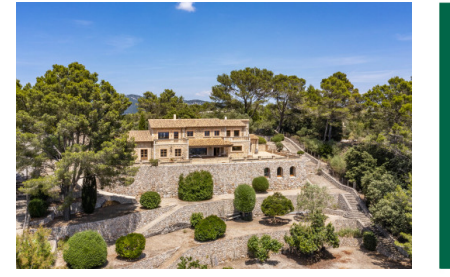
Galilea référence du bien 120182

PORTA MALLORQUINA® Your home. Our passion.