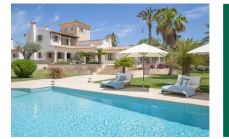
Cas Concos référence du bien 120183

PORTA MALLORQUINA® Your home. Our passion.