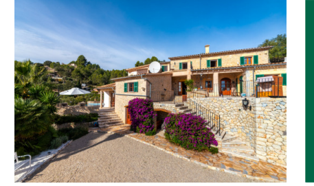
PORTA MALLORQUINA® Your home. Our passion.