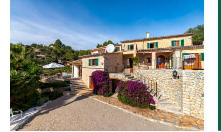
PORTA MALLORQUINA® Your home. Our passion.