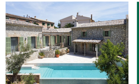
PORTA MALLORQUINA® Your home. Our passion.