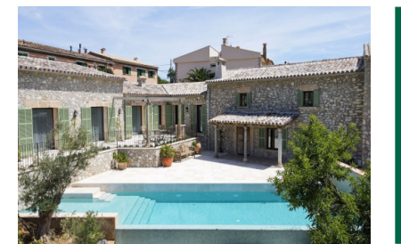
Capdella référence du bien 121259

PORTA MALLORQUINA® Your home. Our passion.