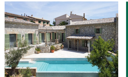
PORTA MALLORQUINA® Your home. Our passion.