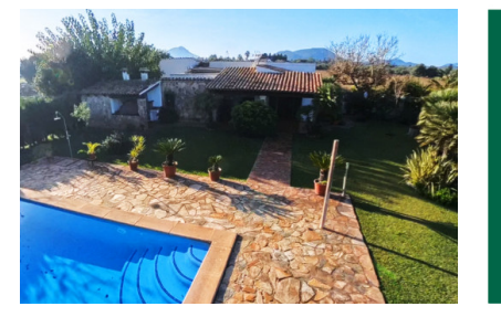
Pollensa référence du bien 122003

PORTA MALLORQUINA® Your home. Our passion.