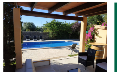
PORTA MALLORQUINA® Your home. Our passion.