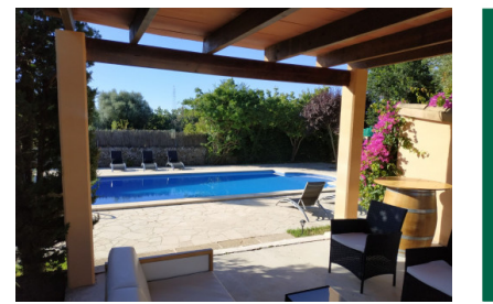
Arta référence du bien 122103

PORTA MALLORQUINA® Your home. Our passion.