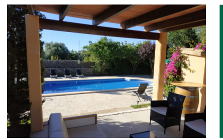
Arta référence du bien 122103

PORTA MALLORQUINA® Your home. Our passion.