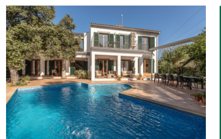
PORTA MALLORQUINA® Your home. Our passion.