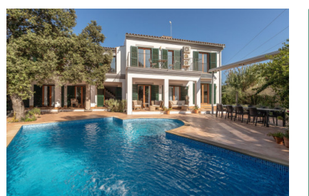
PORTA MALLORQUINA® Your home. Our passion.