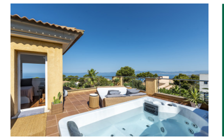
Bahia Azul référence du bien 118412

PORTA MALLORQUINA® Your home. Our passion.