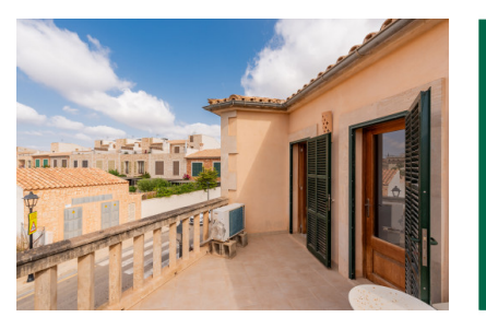
PORTA MALLORQUINA® Your home. Our passion.