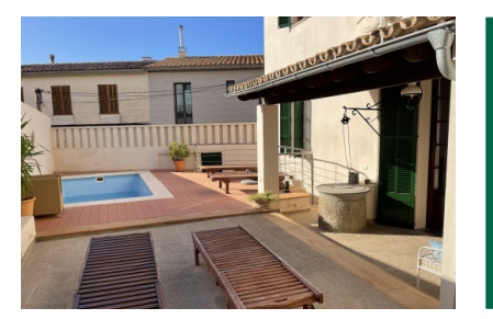
Buger référence du bien 120828

PORTA MALLORQUINA® Your home. Our passion.