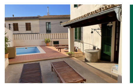
PORTA MALLORQUINA® Your home. Our passion.