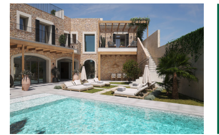
Ses Salines référence du bien 121191

PORTA MALLORQUINA® Your home. Our passion.