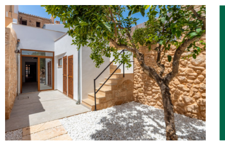
Llucmajor référence du bien 121714

PORTA MALLORQUINA® Your home. Our passion.