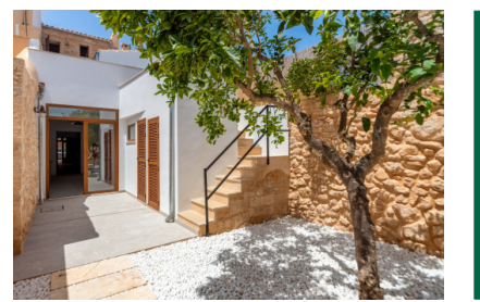
Llucmajor référence du bien 121714

PORTA MALLORQUINA<sup>®</sup> Your home. Our passion.