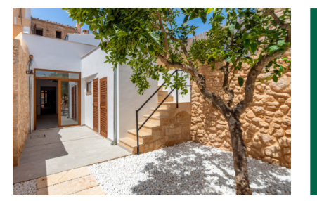
Llucmajor référence du bien 121714

PORTA MALLORQUINA® Your home. Our passion.