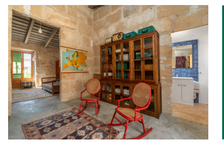
PORTA MALLORQUINA® Your home. Our passion.