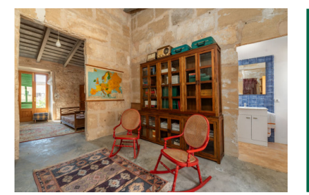
PORTA MALLORQUINA® Your home. Our passion.