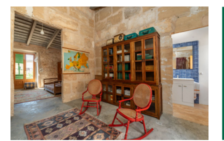
Santanyi référence du bien 121846

PORTA MALLORQUINA<sup>®</sup> Your home. Our passion.