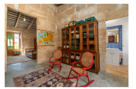
PORTA MALLORQUINA® Your home. Our passion.