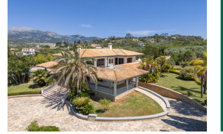
Inca référence du bien 122245

PORTA MALLORQUINA® Your home. Our passion.