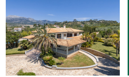
Inca référence du bien 122245

PORTA MALLORQUINA® Your home. Our passion.