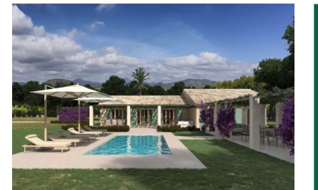
Campos référence du bien 121010

PORTA MALLORQUINA® Your home. Our passion.