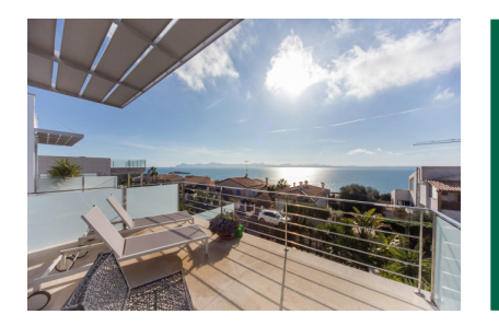
Alcanada référence du bien 109342

PORTA MALLORQUINA® Your home. Our passion.