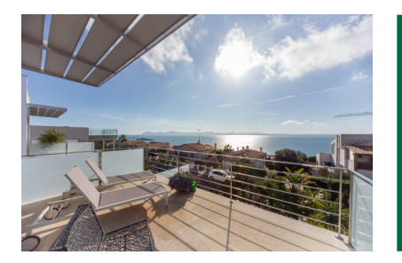
Alcanada référence du bien 109342

PORTA MALLORQUINA® Your home. Our passion.