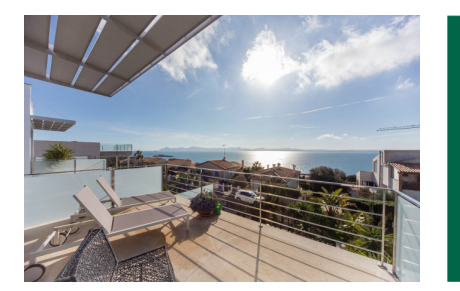
Alcanada référence du bien 109342

PORTA MALLORQUINA® Your home. Our passion.