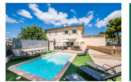
Playa de Muro référence du bien 116859

PORTA MALLORQUINA® Your home. Our passion.