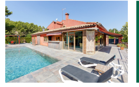
Esporles référence du bien 118704