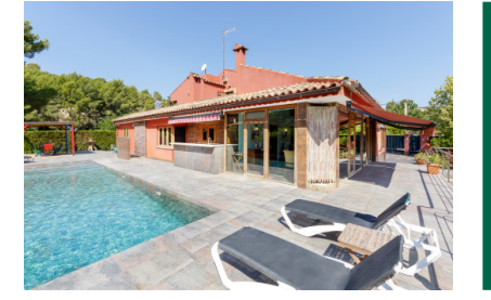
Esporles référence du bien 118704

PORTA MALLORQUINA® Your home. Our passion.