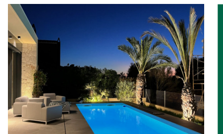
Sa Rapita référence du bien 120687

PORTA MALLORQUINA® Your home. Our passion.